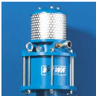
Easy adaptation of the pressure ratio by exchanging the piston plate and cylinder.