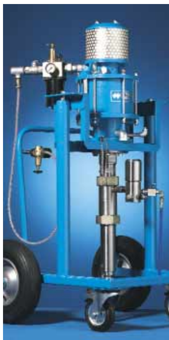
Pump with cart lift

PROFESSIONAL – high- performance at low cost