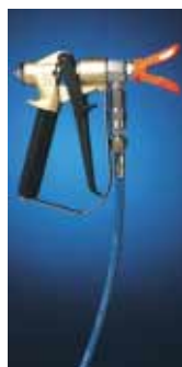
Different accessory sets are available for ready-to-spray versions.