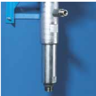
Special threaded fittings make assembly and disassembly of the pump housing simple and precise.