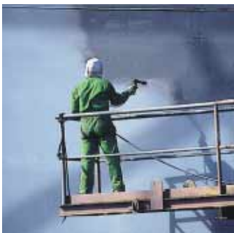
The large surface coverage provided by WIWA PROFESSIONAL pumps meets the high demands of the shipbuilding industry. High-pressure ratios avoid pressure loss over longer distances.