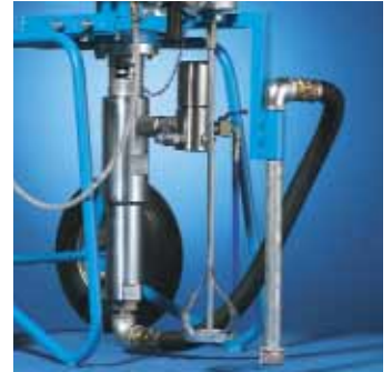
Agitator and suction systems are set exactly according to the individual requirements.