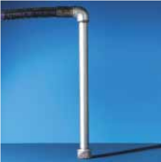
Suction hoses and suction pipes for different paint container sizes and viscosities. Suction filter and suction sieve for different pigmentsizes.