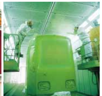
In industrial coating lines and special applications, WIWA PROFESSIONAL equipment proves its strength as a supply pump for jobs requiring several guns.