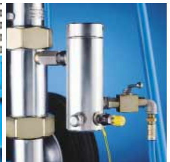
Perfect: The high pressure filter with the improved flush system.