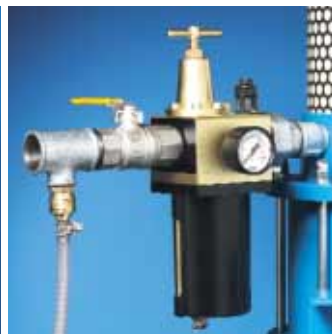
The maintenance unit is installed on the equipment.