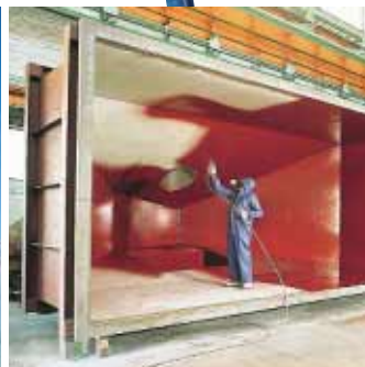
High performance and managability are demanded in the steel construction industry.