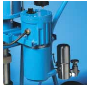
The fluid heater quickly and simply heats the material to be sprayed.