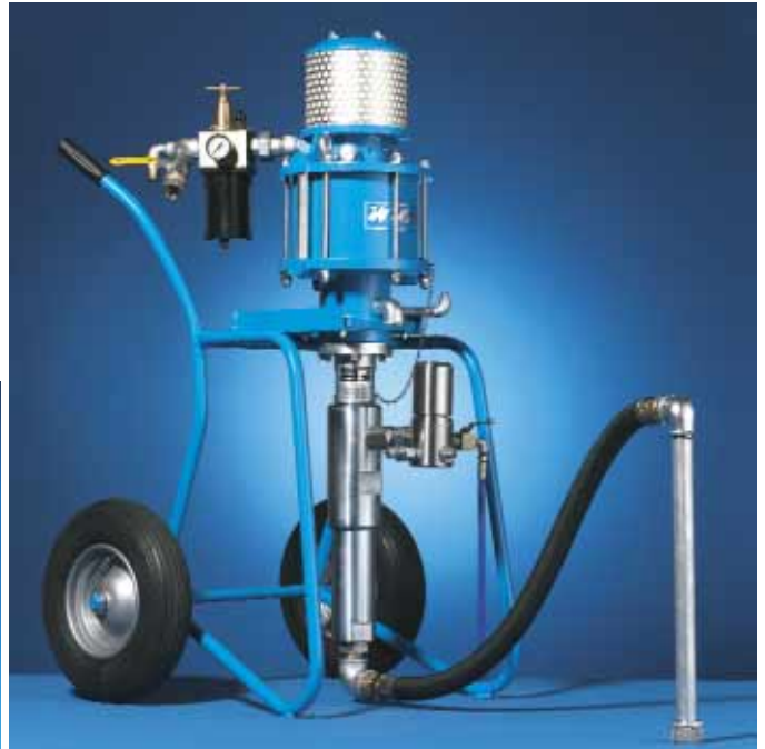
Pump with cart