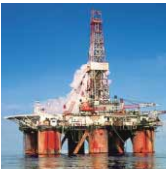
Corrosion protection of offshore structures requires robust technology.