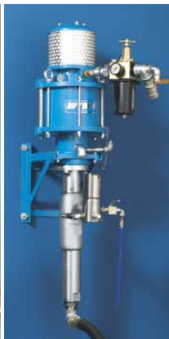
Pump with wall-bracket