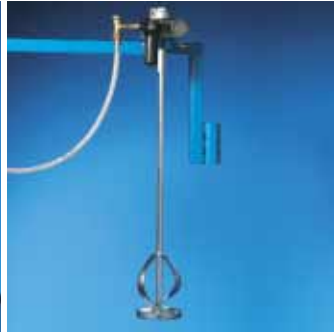
Mounting kit – Agitator for continuous agitation of mate- rials containing zinc and other fast settling extenders.