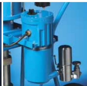
Mounting kit for hot spray Through heating of extremely viscous coating materials, much better results can be achieved and additional solvents saved. The WIWA fluid heater is ideally suited for the use of pumps with high pressure ratios.