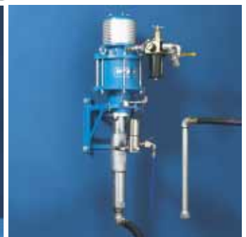
with cart lift (at the left) with wall-mount (above)